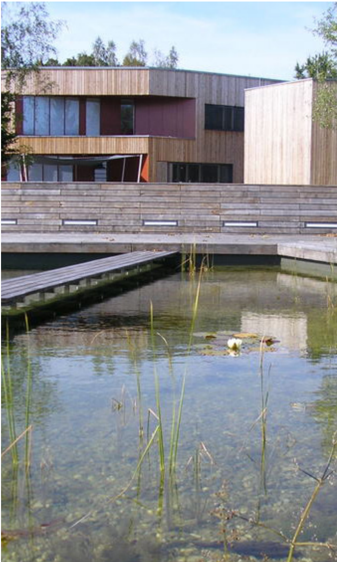
Natural swimming pond