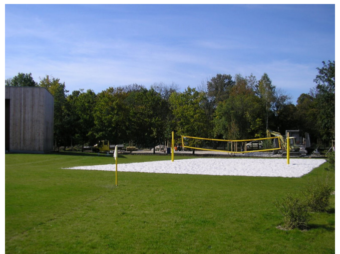
Beach volleyball field