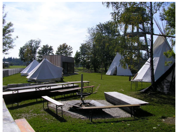
Campsite with a fireplace